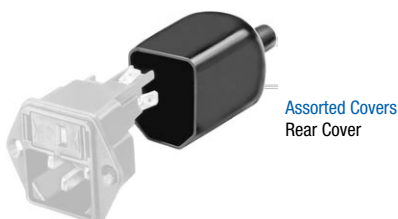
Assorted Covers Rear Cover